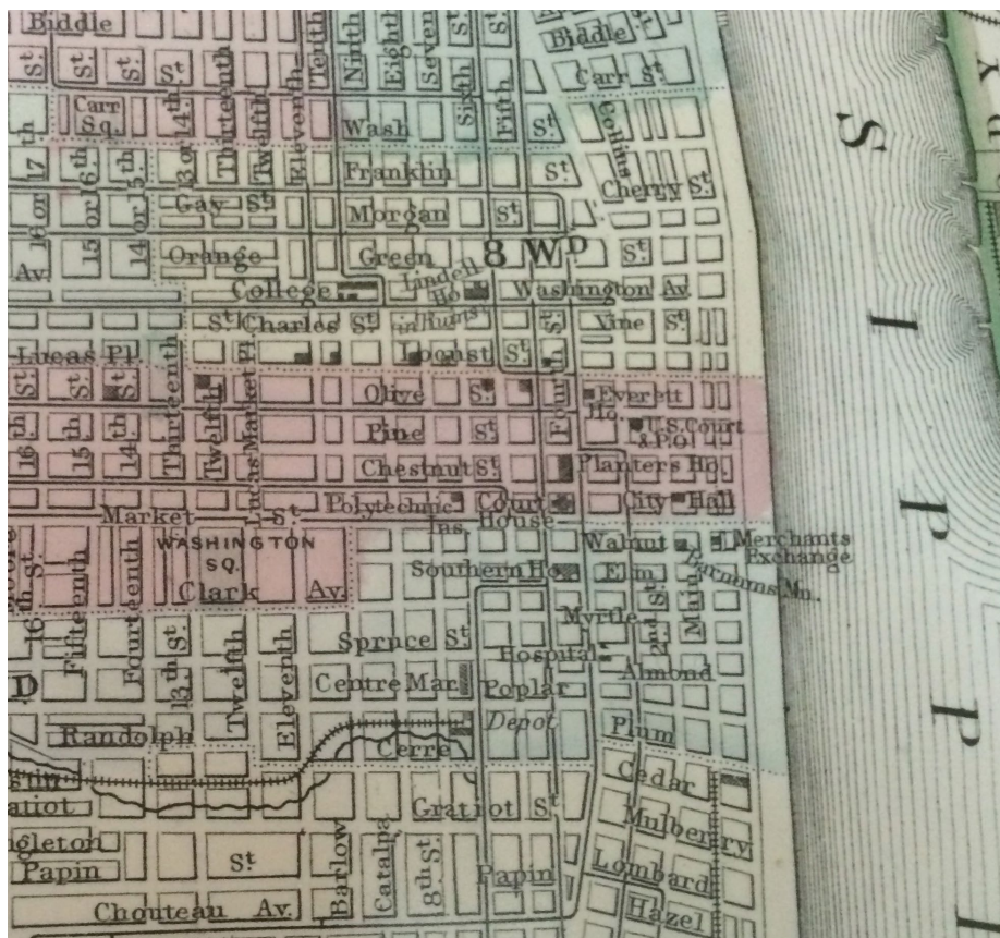
Figure 2 – Eads brought his bridge into the city at Washington Street, just two blocks south of Biddle. The tunnel took trains south and west, into Mill Creek Valley (at bottom) where the

By contrast, James Eads largely sidestepped downtown congestion with his tunnel which took all rail traffic to the south and west – into the Mill Creek Valley.